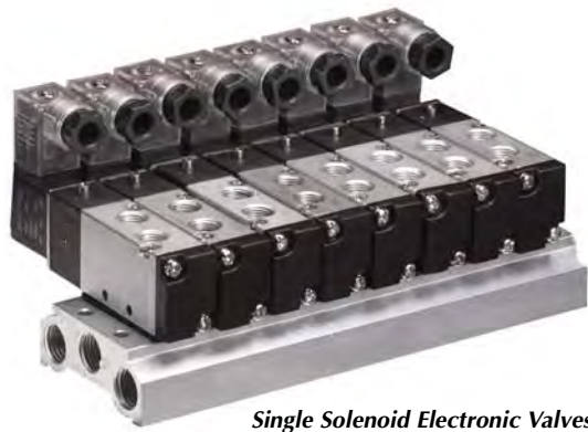
Single Solenoid Electronic Valves Mounted on 8-Station Manifold

Note: This numbering schematic is shown for illustration purposes only. All possible configurations are not available. For standard models, see the products illustrated in this catalog.